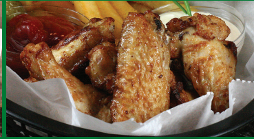
Oven Roasted Wing 4608