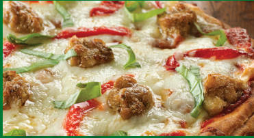
Chicken Sausage Topping 5601