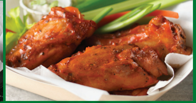
Thigh BoneZ™ 6705

Save more per case for every qualifying product purchased during the promotion period and save up to $7 per case!