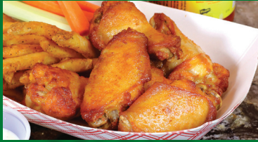
Buffalo-Style Wing 4604